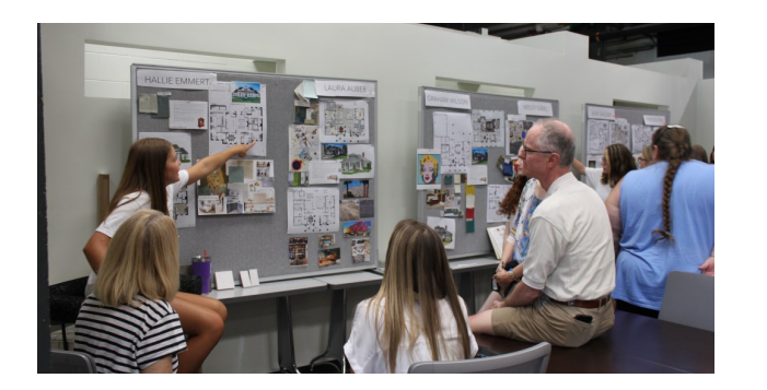
Exhibit Design and Preparation: Create a student work exhibit to share with family and friends.

Lighting Design. Explore the importance of natural and artificial light for physical and psychological health. using our MSU Lighting Application Center to investigate lighting effects.